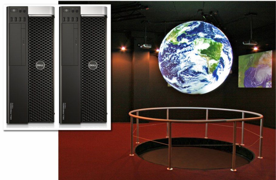
Science on a Sphere® in Planet Theater®, Boulder, Colorado

The computers can be located as much as 200' (~60 m) from the sphere without additional video cable boosters. The computers must be in a clean, well ventilated area.