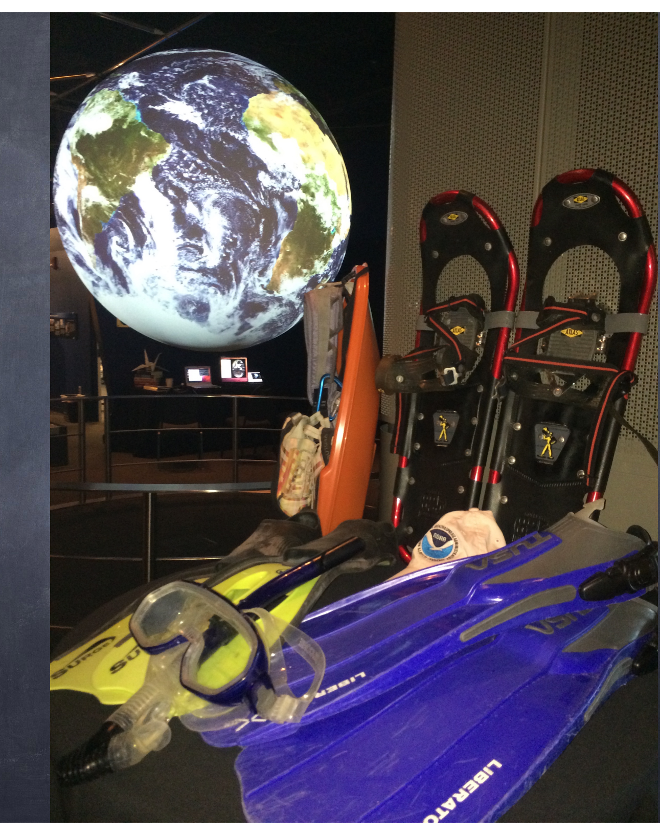
Exhibit: Outdoor activities we like to do